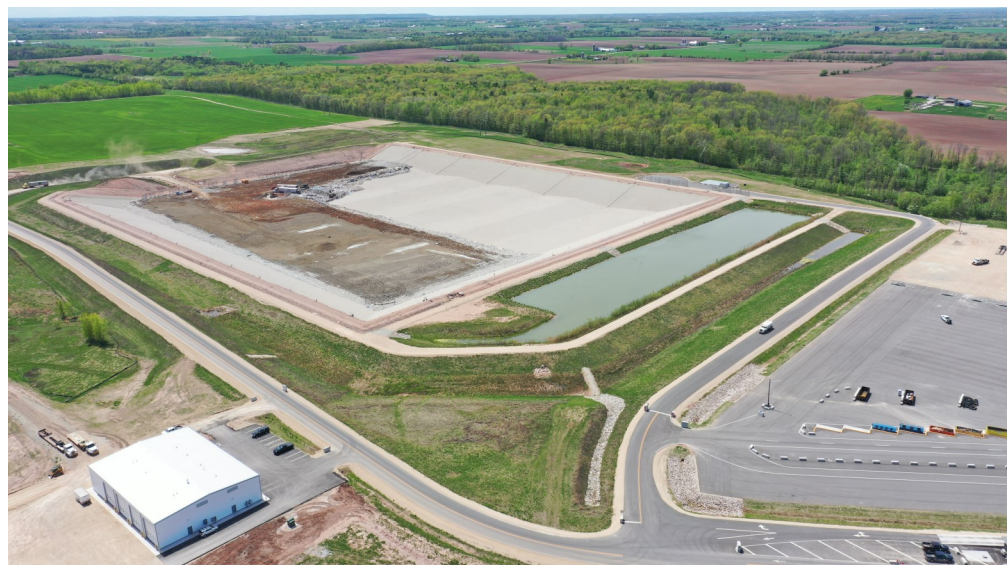
Aerial view of the South Landfill cell (May 2022).