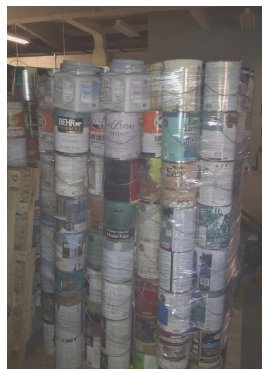
Pallets of latex paint cans collected at Household Hazardous Waste

Latex paint is not hazardous; it can be disposed of with your regular trash, provided that it is completely solidified.