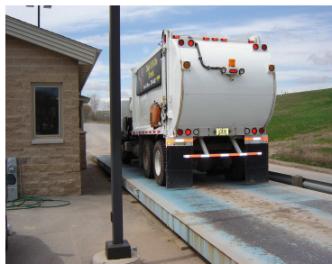
Brown County Waste Transfer Station Scale

For Solid Waste , contact: Chad Doverspike (920) 492-4955 Doverspike_cc@co.brown.wi.us