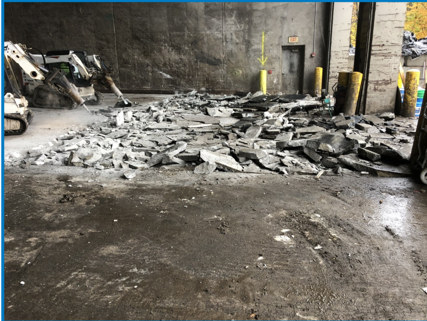
A jackhammer excavates the 4 inch concrete floor of the Waste Transfer Station.