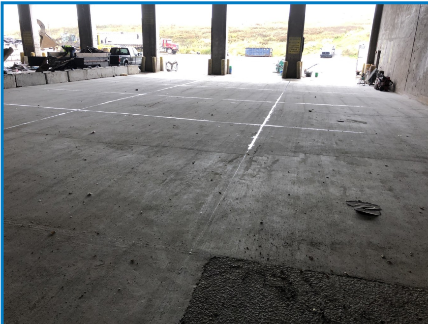
New concrete floor, ready for operation

On an average day, the Brown County Solid Waste Transfer Station accepts 750-850 tons of solid waste from residential and commercial customers. Over time the had deteriorated to the point where it needed to be replaced.